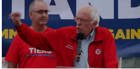
The UAW's leadership and affiliates regularly welcome socialist economic ideas from extremists like Bernie Sanders, as well as caustic anti-Israel rhetoric. Workers who try to dissociate from the union often face an uphill battle.