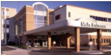
Four Mount Clemens General Hospital nurses defied union bosses' orders to leave their patients during a strike.

Union officials withdraw threats against nurses who refused to abandon their patients