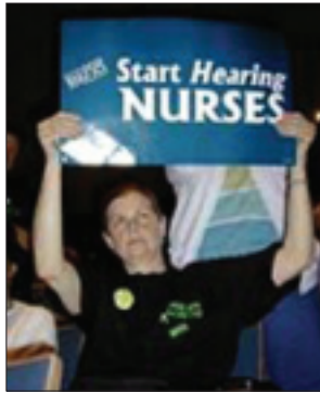
When union officials order health care workers onto the picket line, patients are abandoned.