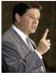
A high profile AFL-CIO official recently came under fire for failing to disclose funds funneled into public attacks on Majority Leader Tom DeLay (left).