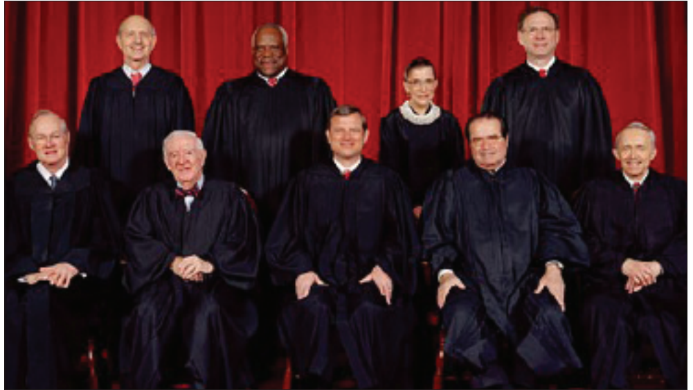
The U.S. Supreme Court has an opportunity to reverse the Washington State Supreme Court majority that “turned the First Amendment on its head.”

Immediately after the passage of Washington State’s campaign finance